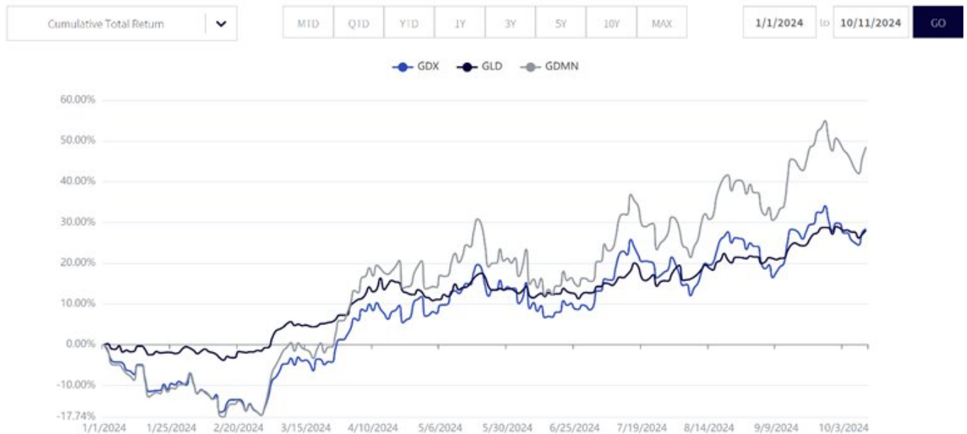
Figure 4: Year-to-Date Performance

NAV denotes total return