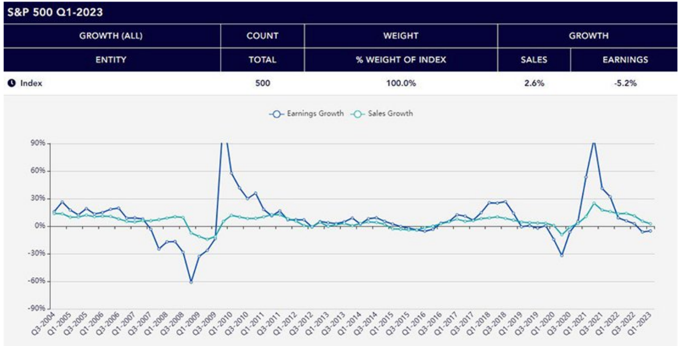
Sources: WisdomTree, FactSet, as of 4/27/23. Q1-2023 refers to companies with financial report periods between 2/16/23 and 5/15/23