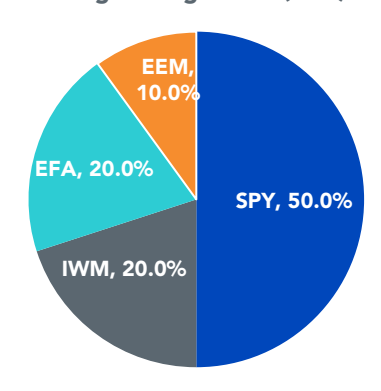
WisdomTree Target Range Fund (GTR) Exposure

EEM=iShares MSCI Emerging Markets ETF, EFA=iShares MSCI EAFE ETF, IWM= iShares Russell 2000 ETF, SPY=SPDR S&P 500 ETF Trust