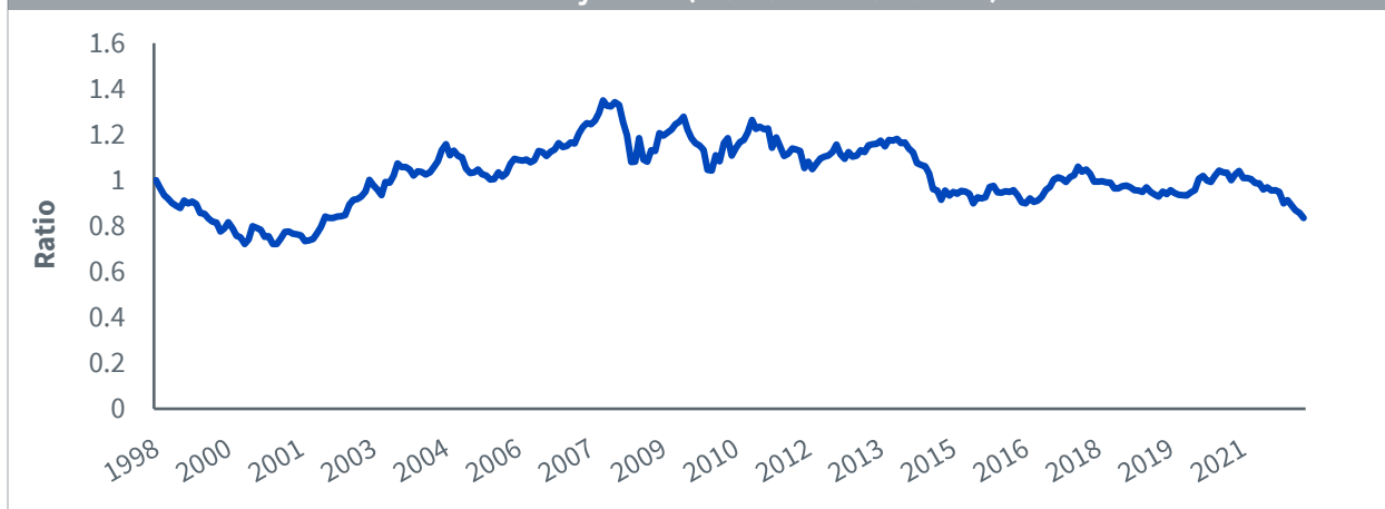
Figure 1: Currency Impact on Cumulative Returns of MSCI EMU Small Cap Index vs. MSCI EMU Small Cap Local Currency Index (04/30/1998–9/30/2022)

Source: WisdomTree, FactSet. Ratio is computed by dividing MSCI EMU Small Cap Index by MSCI EMU Small Cap Local Currency Index. Past performance is not indicative of future results. You cannot invest directly in an index.