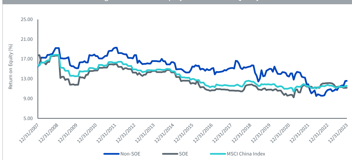
Figure 4: Return on Equity as a Measure of Quality

Sources: FactSet, MSCI, WisdomTree, as of 12/31/2007 – 12/31/2023. Past performance is not indicative of future results. You cannot invest directly in an index.