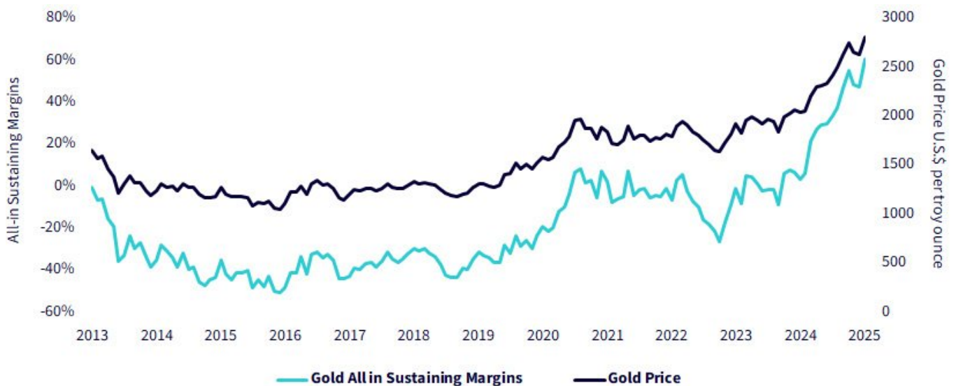
Figure 4: All-in Sustaining Margins Buoyed Higher by Rising Margins