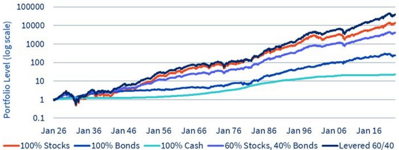
Figure 1: Extension of the results from Cliff Asness' paper– 1926-2023

In Figure 1, we extended the Asness analysis to the most recent period. We observe that over this longer period, the results still hold true. The Levered 60/40 delivers higher returns than equities with similar volatility. The Sharpe ratio of the Levered 60/40 benefits from the diversification and is improved, compared to equities, with no cost to returns themselves.