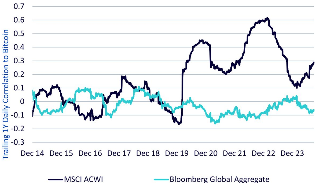
Figure 3: Trailing one-year daily correlation to bitcoin

From 31 December 2014 to 30 September 2024. You cannot invest directly in an index. Historical performance is not an indication of future performance and any investment may go down in value.