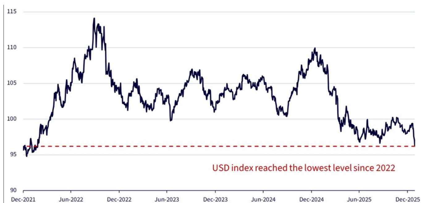
Figure 1: USD index (DXY index) reached the lowest level since 2022

You cannot invest directly in an index. Historical performance is not an indication of future performance, and any investments may go down in value.