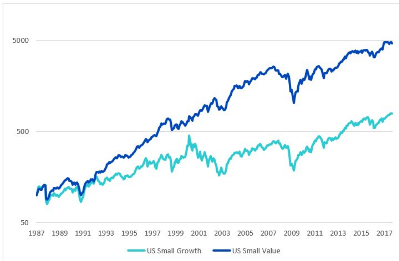
Figure 2: Small-cap value outperforms growth (Average value-weighted monthly returns: Small LoBM vs Small HiBM)

dividend-paying stocks provides a value tilt, whilst also offering an enhanced way of accessing size as a risk premia.