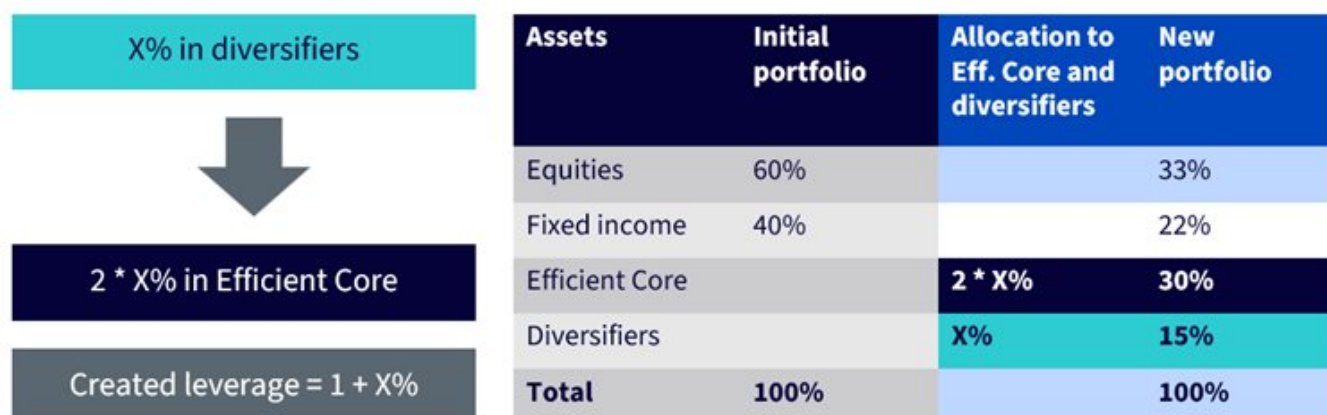
Figure 3. Illustration of Step 1.