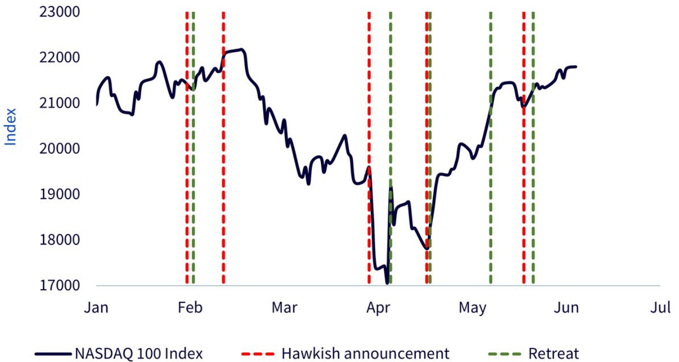
Figure 1: The NASDAQ 100 Index shows the TACO trade is real

Historical performance is not an indication of future performance, and any investments may go down in value.