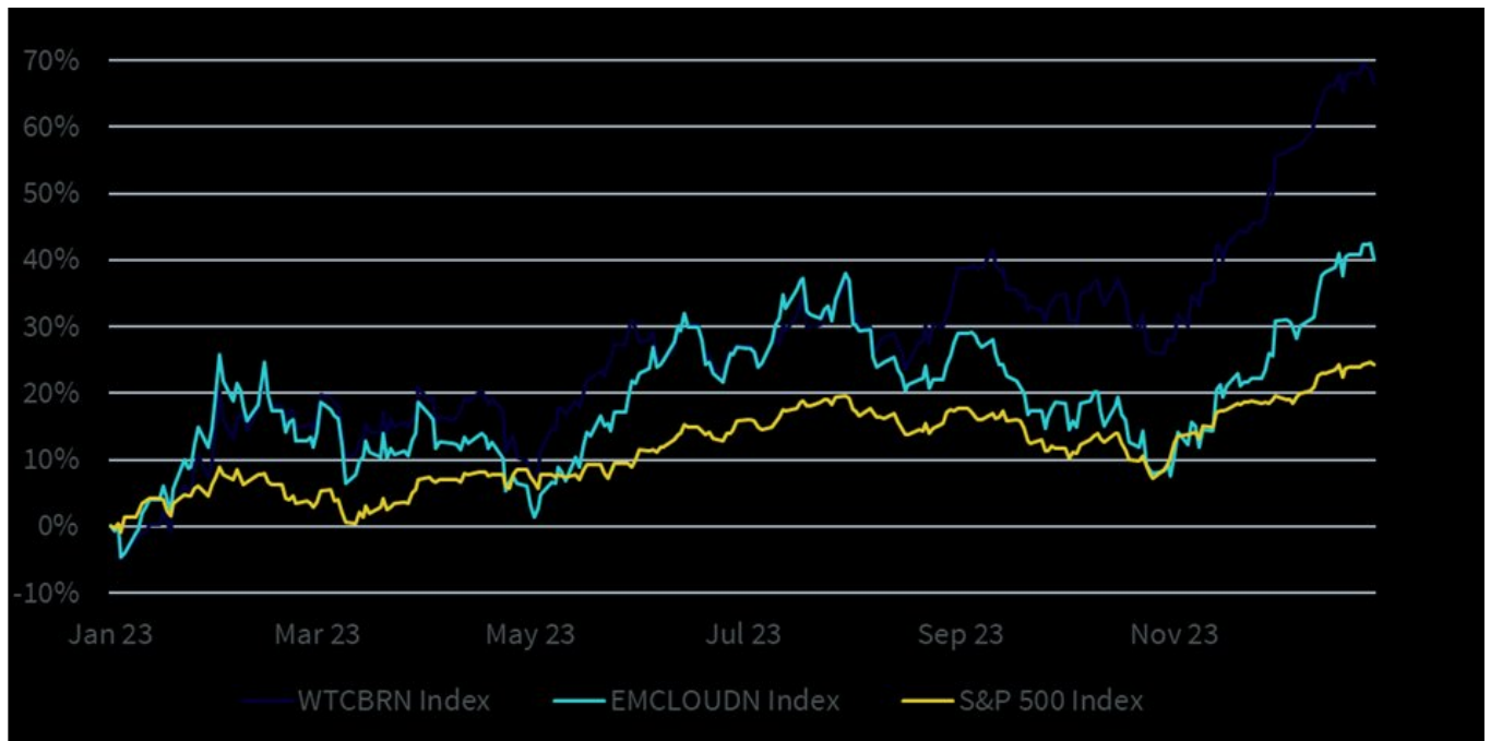
Figure 2: 2023 Returns of WTCBRN and EMCLOUDN were quite strong

Daily data from 02 January 2023 to 29 December 2023. Calculations are based on returns in USD. You cannot invest directly in an index. Historical performance is not an indication of future results and any investments may go down in value.