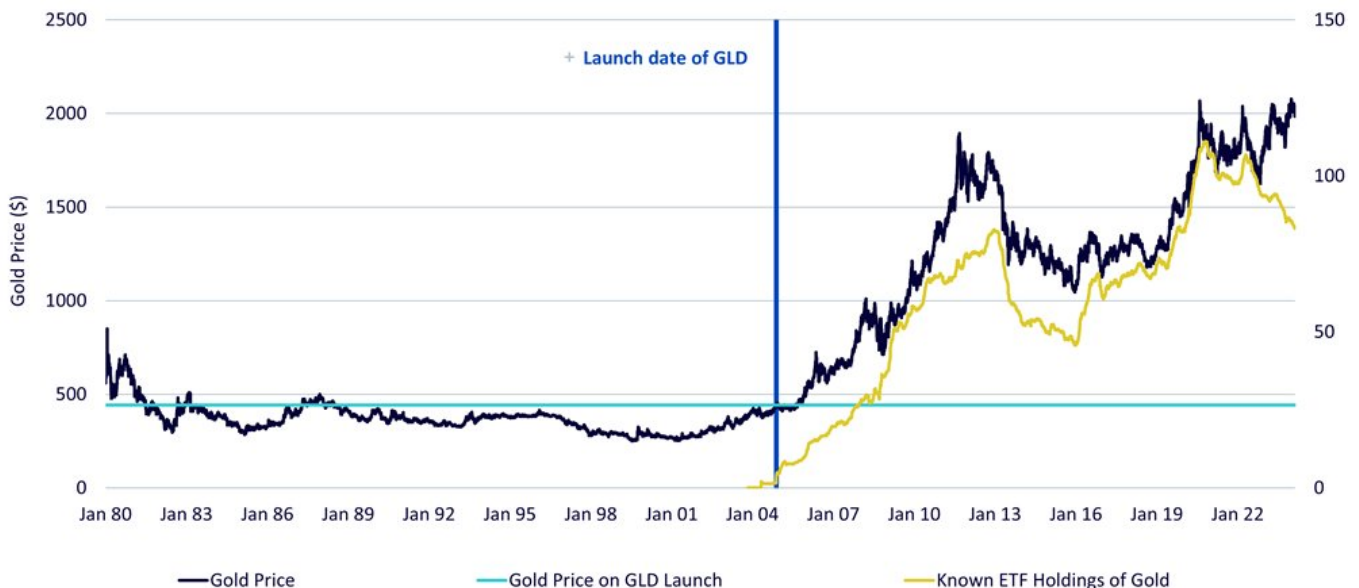
Figure 2: New investment access for investors can lead to supply/demand shock

From 1st January 1980 to 14 February 2024. In USD. GLD stands for SPDR Gold Shares and is the biggest Gold Exchange Traded Product in the world. Historical performance is not an indication of future performance and any investment may go down in value.