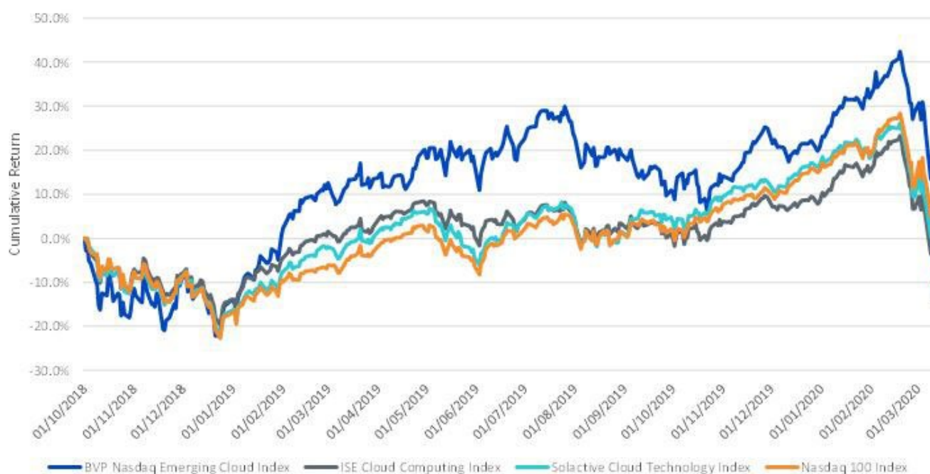
Figure 1a: Comparison of Cumulative Returns (2 October 2018 to 13 March 2020)