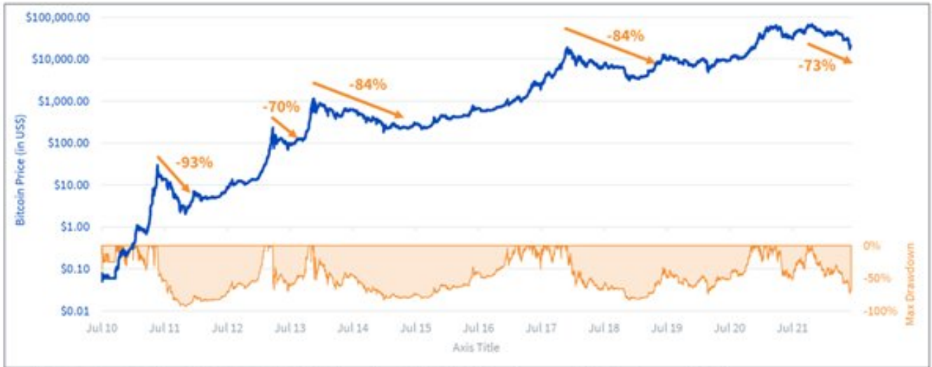
Source: WisdomTree, Bloomberg. Data from July 2010 to June 2022. Historical performance is not an indication of future performance and any investments may go down in value

WisdomTree has summarised this history in approximately four phases so far, which are explained in-depth in the new report ‘WisdomTree Insights - A New Asset Class: Investing in the Digital Asset Ecosystem’: