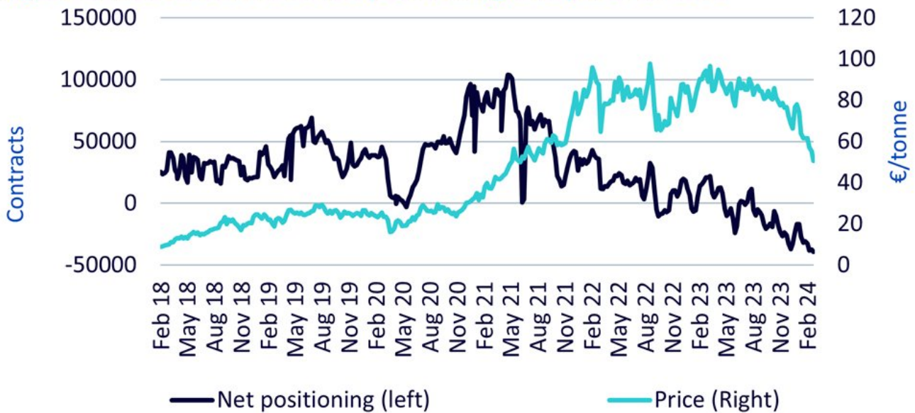
Figure 2: Investment fund net positioning and price of EUAs

February 2018 – February 2024. Weekly data. Historical performance is not an indication of future performance and any investments may go down in value.