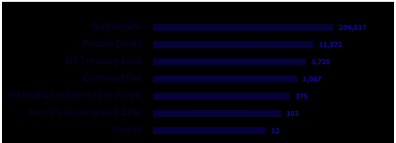
Figure 2: Financial services are moving to the blockchain: tokenised assets, log scale USD billion

Historical performance is not an indication of future performance and any investments may go down in value.