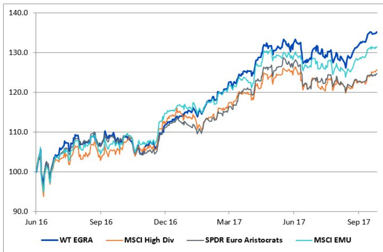
Figure 3: Quality Dividend Growth delivers outperformance