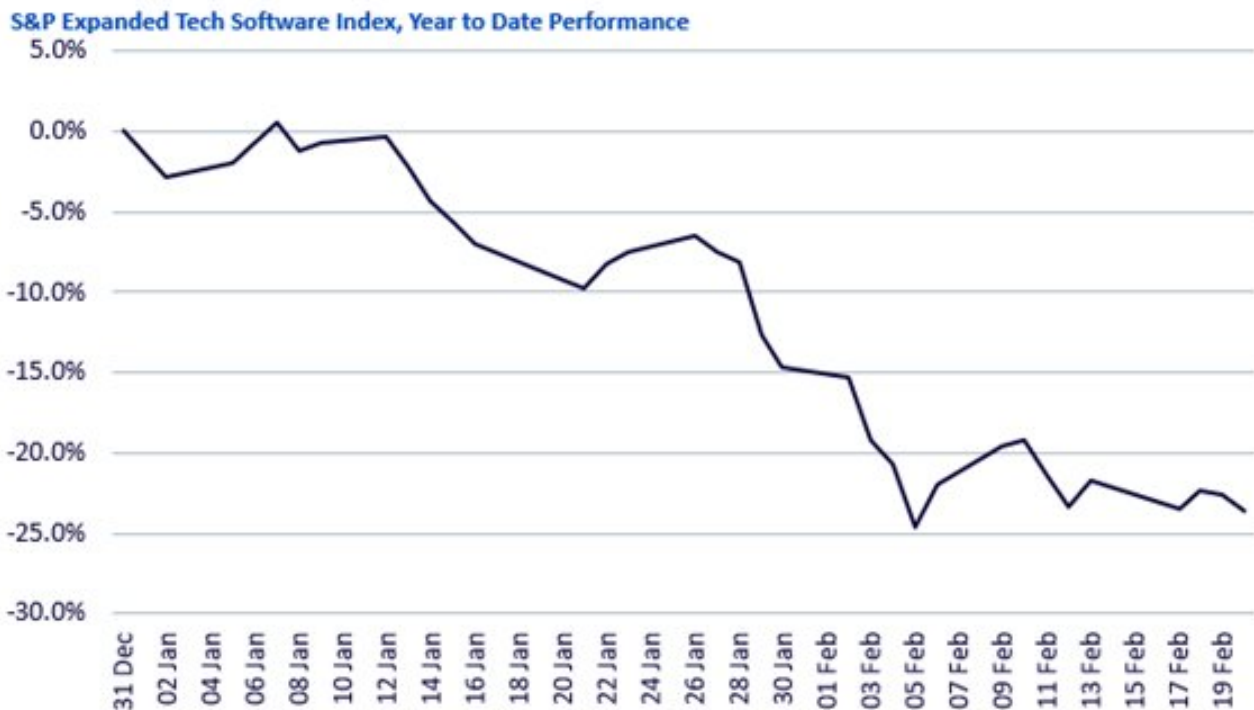
Figure 2: "SaaSocalypse"

Source: Bloomberg as of 20 February 2026. Software performance represented by the S&P North American Expanded Technology Software Total Return Index. You cannot invest directly in an index. Historical performance is not an indication of future performance and any investments may go down in value.