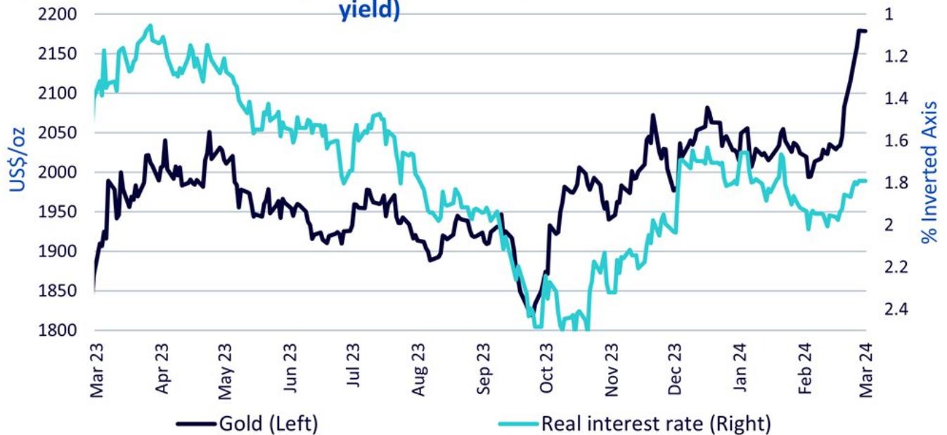
Figure 2: Gold vs real rates (treasury inflation-protected securities yield)

11 March 2023 - 11 March 2024. Historical performance is not an indication of future performance and any investments may go down in value.