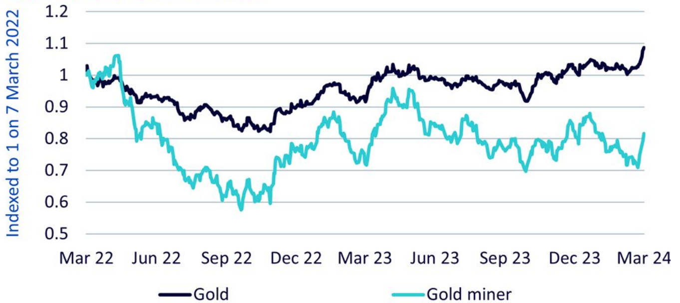
Figure 3: Gold vs Gold miners

7 March 2022 - 7 March 2024. Historical performance is not an indication of future performance and any investments may go down in value.