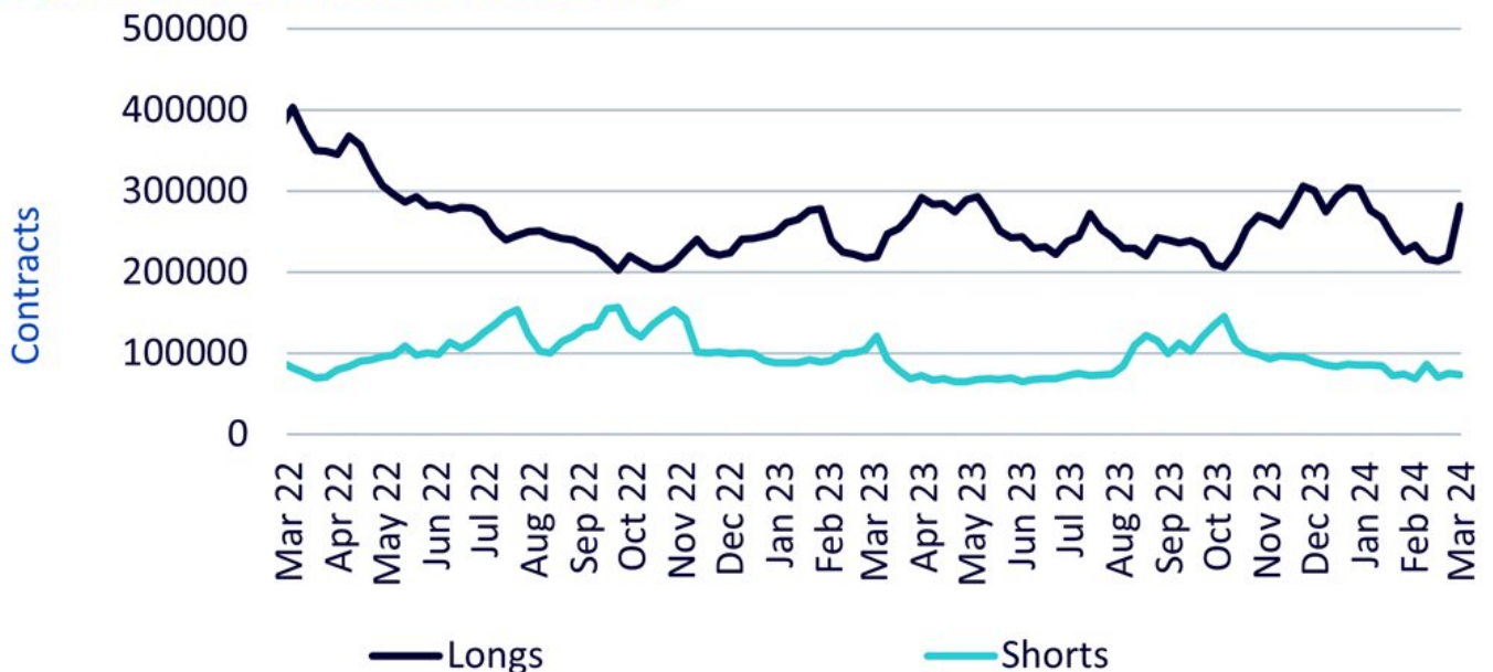
Figure 1: Gold Futures Positioning

5 March 2022 - 5 March 2024. Historical performance is not an indication of future performance and any investments may go down in value.