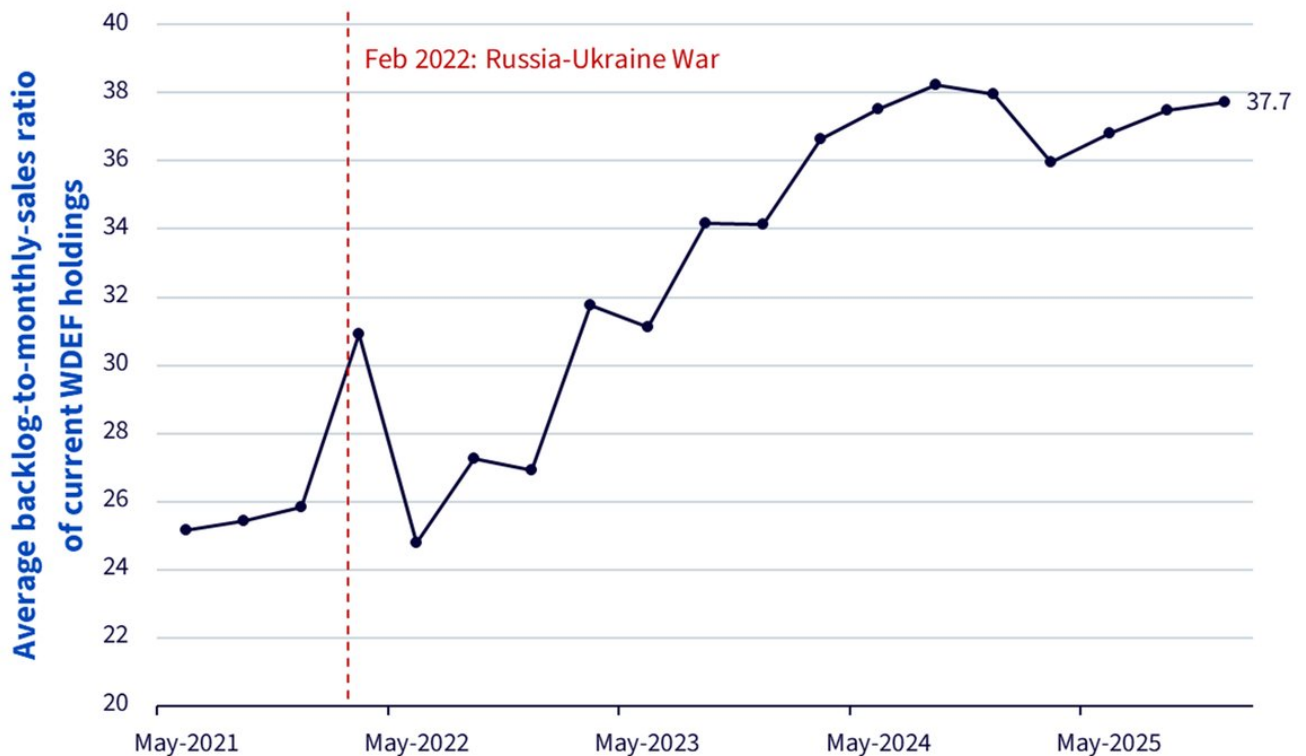
Figure 3: Average backlog to monthly sales ratio of holdings in the WisdomTree Europe Defence UCITS Index

For each holding, backlog to monthly sales ratio calculated as Order Backlog Value / (Trailing 12M Net Sales/12). Data as of 21 November 2025. All holdings in the WisdomTree Europe Defence UCITS Index with available data are included in the calculation. You cannot invest directly in an index. Historical performance is not an indication of future performance and any investments may go down in value.