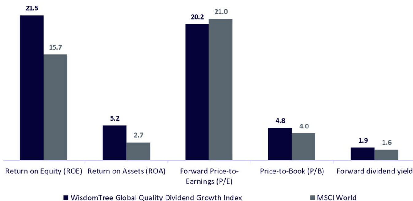
Figure 3: Portfolio fundamentals

Value: top 30% book-to-price portfolio. Size: bottom 30% portfolio. Quality: top 30% portfolio. Low Volatility: bottom 20% portfolio. High Dividend: top 30% portfolio. Market: all CRSP firms incorporated in the US and listed on the NYSE, AMEX or NASDAQ. Historical performance is not an indication of future performance, and any investments may go down in value.