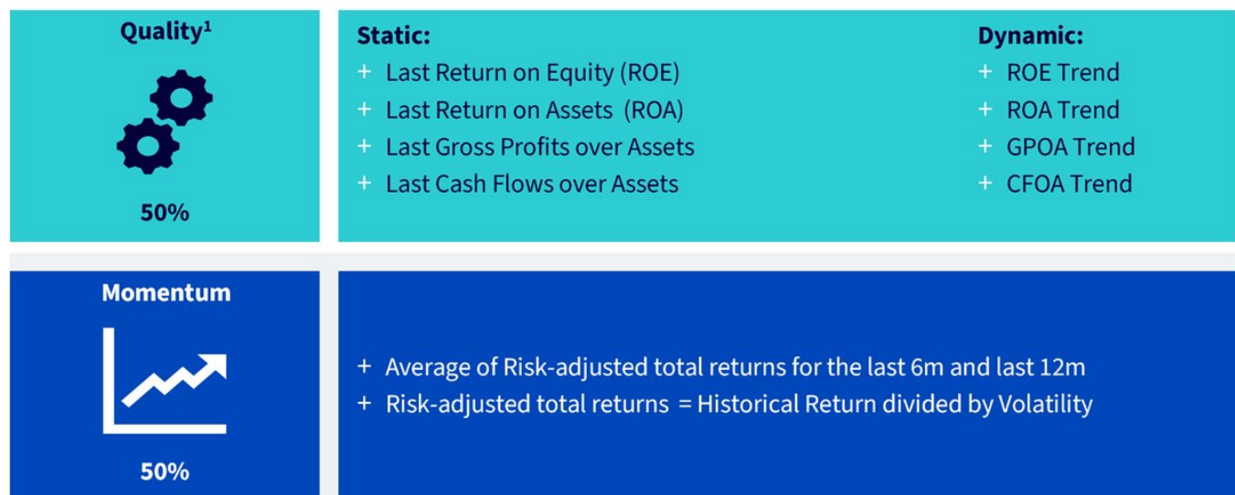
Figure 3: The WisdomTree Composite Risk Score (CRS) composition

1. The Quality score is an equal weight of the 8 scores (at least 6 data points (3 and 3) are needed per stock to be included). Data is normalised using a cross-sectoral Z-score for each industry group. Trends are calculated as 12-quarter historical Z-scores for each industry group.