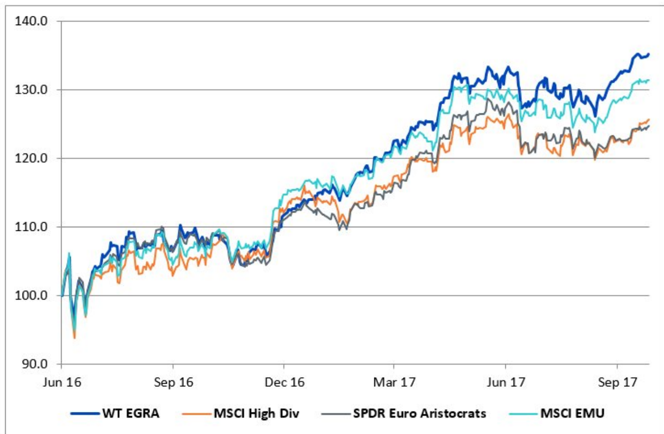
Figure 3: Quality Dividend Growth delivers outperformance