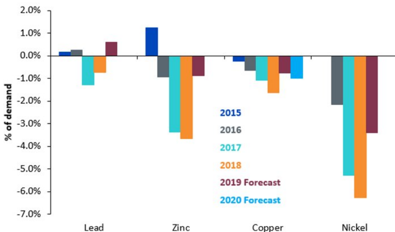
Figure 1: Metal supply in deficit

Nickel is already in one of the deepest supply deficits of all base metals. But a ban on Indonesian ore exports that was expected in 2022 has been brought forward to January 2020. That could leave nickel markets severely undersupplied. Although there is enough inventory to meet short-term needs, there is a risk of deepening deficits.