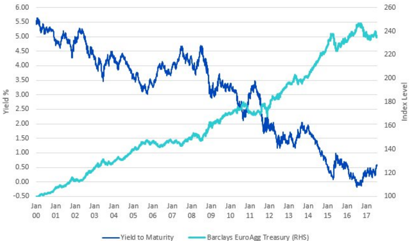
Chart 1: Euro government bonds at close to all-time highs

Markets have already had a sharp correction from the unparalleled instances of 10-year Bund yields hitting a low of -0.2% in early July 2016. Since its peak in early August 2016, the Bloomberg Barclays Euro Aggregate Treasury Index has fallen by over 4.1%. This contrasts with overall annualised returns of over 4.8% that investors have enjoyed from 1998 to the end of 2016.