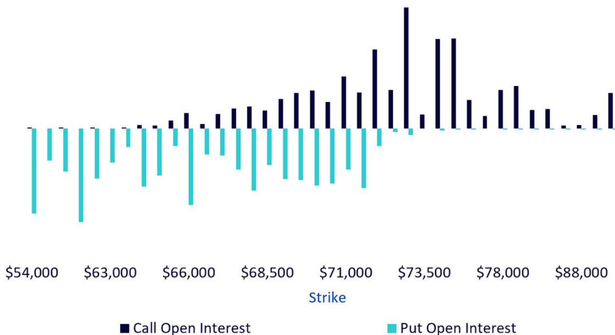
Figure 1: Options strike map

From 28 February 2026 to 07 April 2026. Historical performance is not an indication of future performance, and any investment may go down in value.