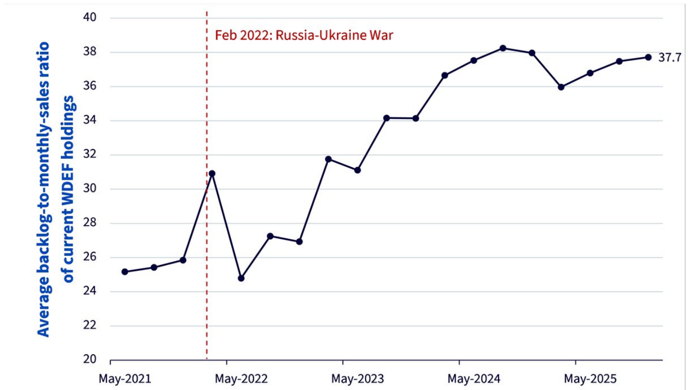
Figure 1: Average backlog-to-monthly-sales ratio of holdings in the WisdomTree Europe Defence UCITS Index

For each holding, backlog to monthly sales ratio calculated as Order Backlog Value / (Trailing 12M Net Sales/12). Data as of 21 November 2025. All holdings in the WisdomTree Europe Defence UCITS Index with available data are included in the calculation. You cannot invest directly in an index. Historical performance is not an indication of future performance and any investments may go down in value.