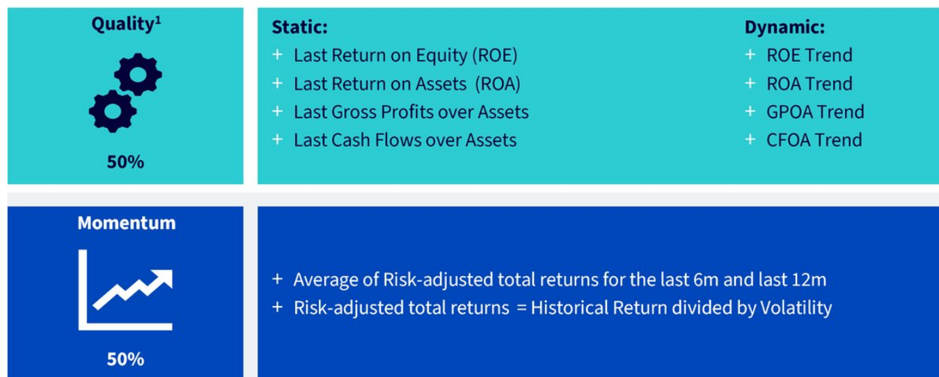
Figure 3: The WisdomTree Composite Risk Score (CRS) composition

1. The Quality score is an equal weight of the 8 scores (at least 6 data points (3 and 3) are needed per stock to be included). Data is normalised using a cross-sectoral Z-score for each industry group. Trends are calculated as 12-quarter historical Z-scores for each industry group.