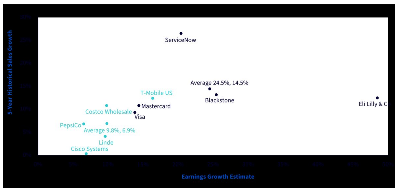
Figure 3: Top unique stocks in WisdomTree US Quality Growth versus unique stocks in NASDAQ 100

As of 31 December 2024. You cannot invest directly in an index.