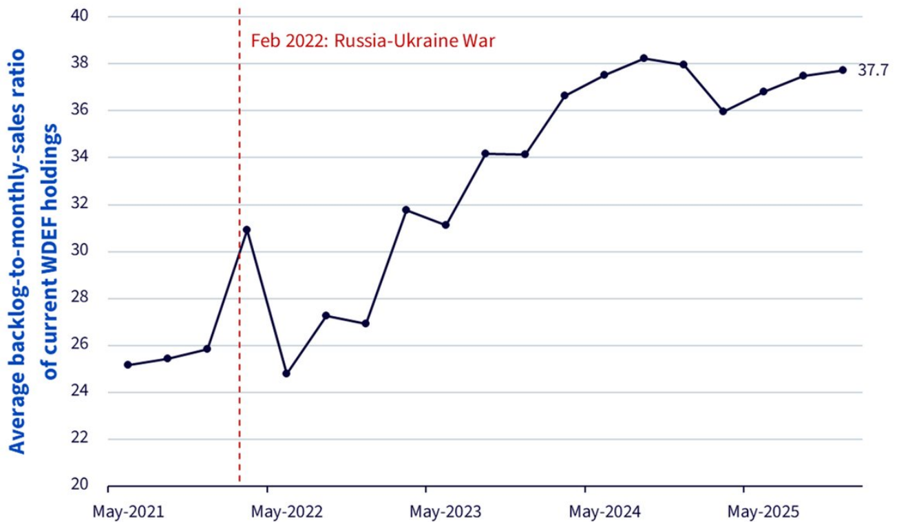
Figure 3: Average backlog to monthly sales ratio of holdings in the WisdomTree Europe Defence UCITS Index

For each holding, backlog to monthly sales ratio calculated as Order Backlog Value / (Trailing 12M Net Sales/12). Data as of 21 November 2025. All holdings in the WisdomTree Europe Defence UCITS Index with available data are included in the calculation. You cannot invest directly in an index. Historical performance is not an indication of future performance and any investments may go down in value.