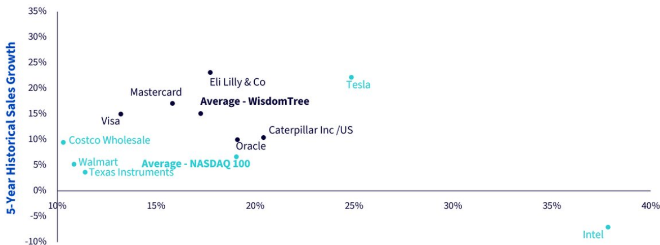
Earnings Growth Estimate

As of 29 May 2026. Historical performance is not an indication of future performance and any investments may go down in value.