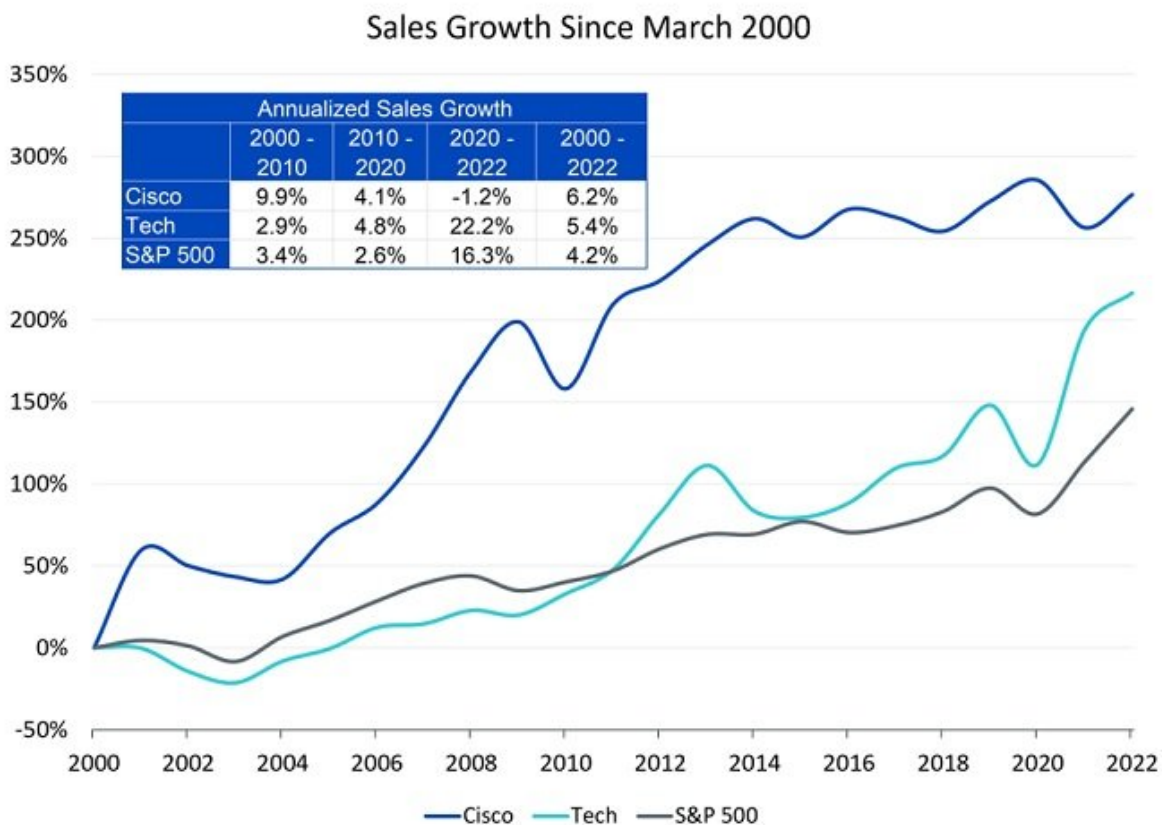
Figure 2: Sales growth of the S&P 500, tech sector, and Cisco since March 2000

Even against the competition, Cisco's status as a tech titan was undeniable and the company was even able to maintain an annual sales growth rate of 9.9% for the decade after it reached its peak P/S valuation in March 2000, almost triple the market's 3.4%. Over the next 22 years, Cisco's sales growth slowed and currently stands at about 6.2% annually, which is still much higher than the market's 4.2% and the tech sector's 5.4% annual sales growth. However, despite strong growth and continued (albeit shrinking) market dominance, its stock has still not recovered to its early-2000 highs.