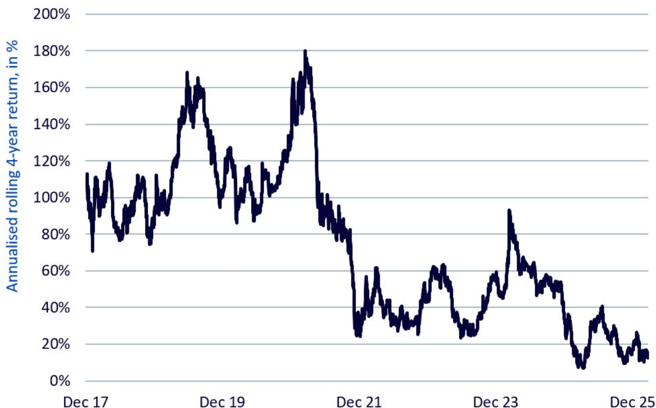
Figure 1: Bitcoin has delivered positive 4-year annualised rolling returns across all observed periods

Source: WisdomTree, Artemis Terminal. 23 March 2026. You cannot invest directly in an index. Historical performance is not an indication of future performance, and any investment may go down in value.