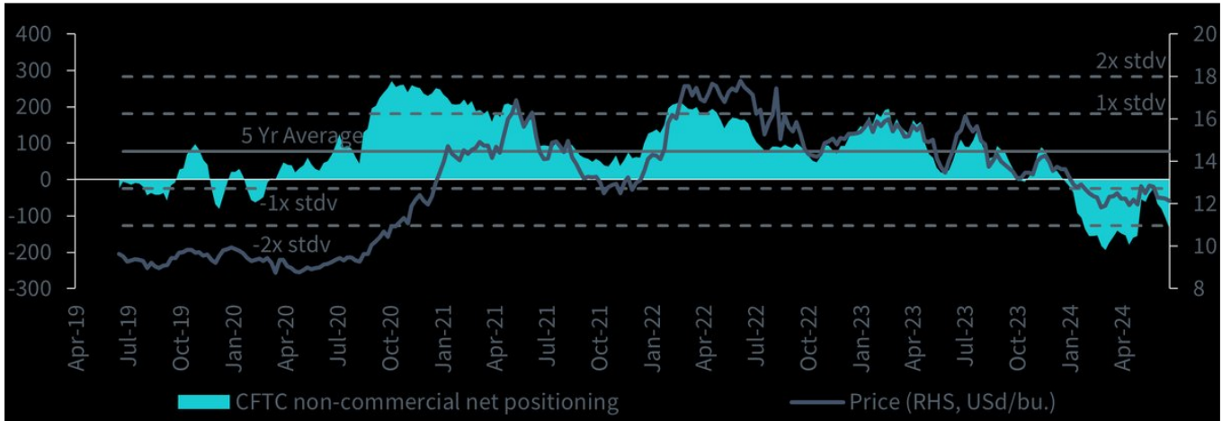
Source: Bloomberg, Commodity Futures Trading Commission, WisdomTree as of 25 June 2024. Historical performance is not an indication of future performance and any investments may go down in value.