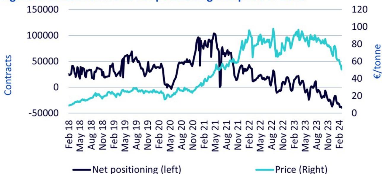
Figure 2: Investment fund net positioning and price of EUAs

February 2018 – February 2024. Weekly data. Historical performance is not an indication of future performance and any investments may go down in value.