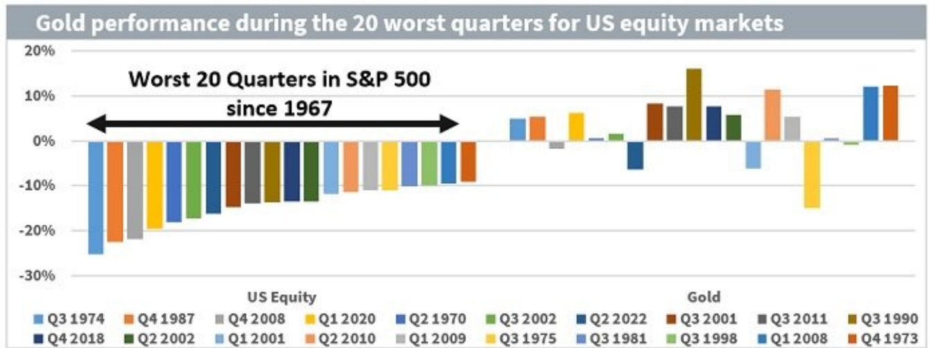
Figure 2: Gold performance during the 20 worst quarters for US equity markets