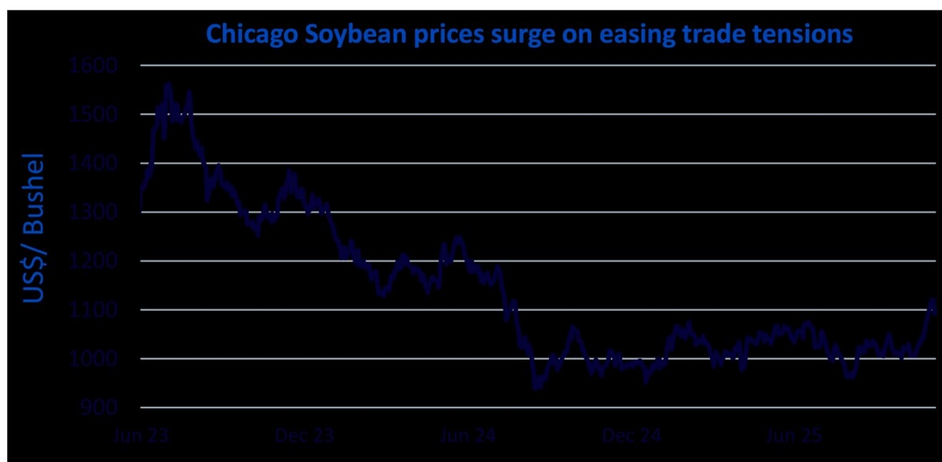
Figure 1: Global rare earth reserves

Historical performance is not an indication of future performance and any investments may go down in value.