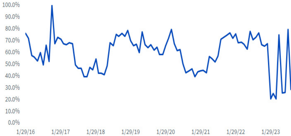
Figure 4: Hedge Ratio for WisdomTree Dynamic Currency Hedged International Dividend Equity Index

Sources: WisdomTree, 1/29/16–10/3/23. You cannot invest directly in an Index. Hedge ratio capped at 100% when hedge contract and equity are slightly mismatched due to market movements.