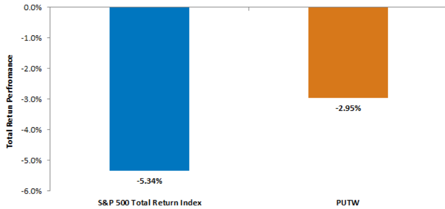
Past performance is not indicative of future results. You cannot invest directly in an index.