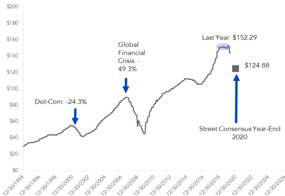
Figure 1: S&P 500 Index Earnings per Share

Sources: WisdomTree, Bloomberg, 12/30/1994–5/26/2020. Past performance is not indicative of future results. You cannot invest directly in an index.