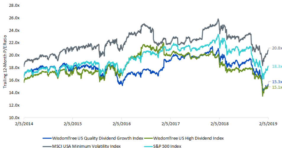
Figure 1: Minimum Volatility Stocks Are Expensive in February 2019

Past performance is not indicative of future results. You cannot invest directly in an index.