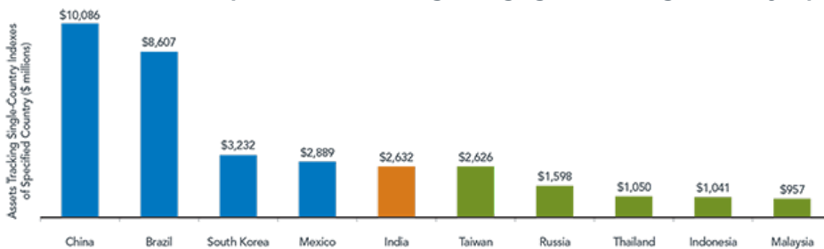
Top 10: Assets Tracking Emerging Market Single-Country Equity Indexes