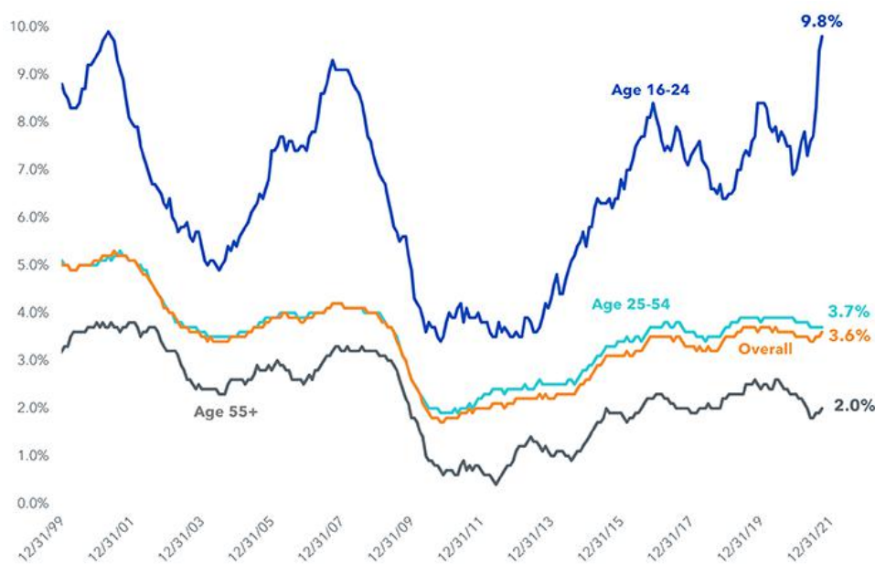
Figure 1: Atlanta Fed Wage Growth

Sources: Current Population Survey, Bureau of Labor Statistics, Atlanta Fed, as of September 2021. The data is 12-month moving averages of monthly median wage growth for each category. Wages computed on an hourly basis.