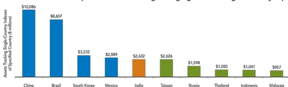
Top 10: Assets Tracking Emerging Market Single-Country Equity Indexes

Source: Bloomberg, data as of 3/31/2013.