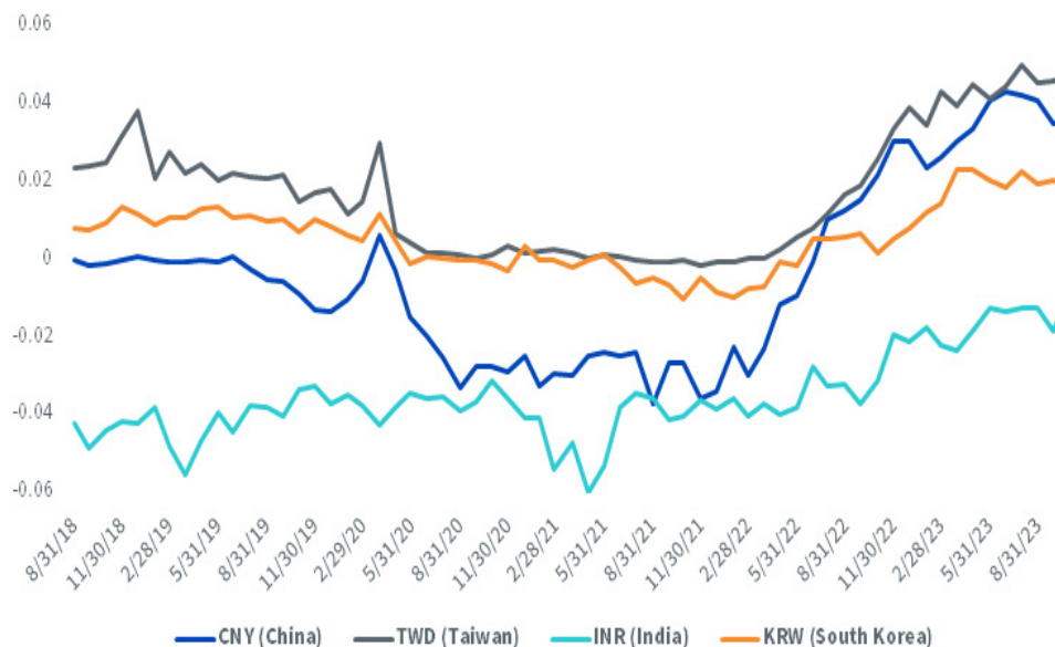
Figure 2: Annualized Carry of Major Emerging Market Currencies