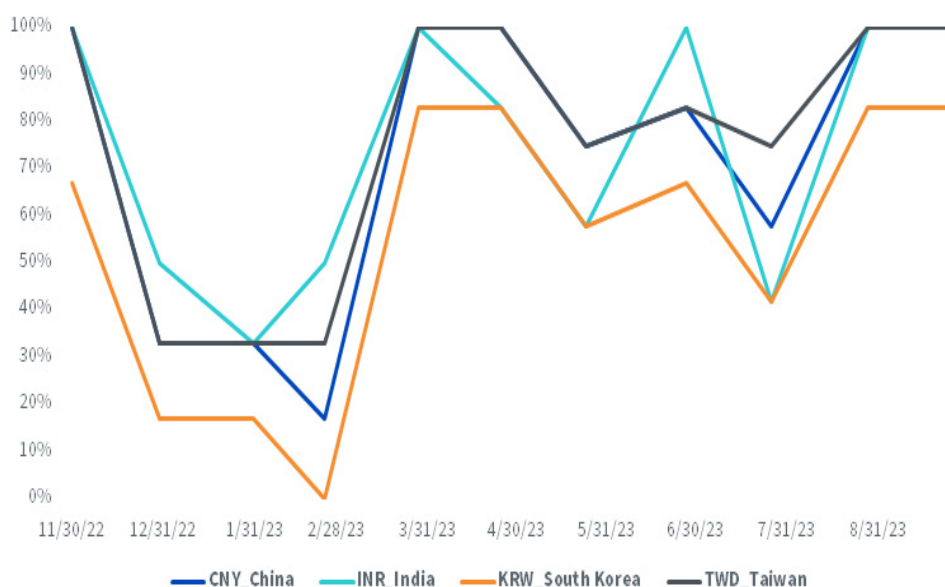
Figure 3: Dynamic Currency Hedge Ratios Used in the WisdomTree Emerging Markets Multifactor Strategy

Sources: WisdomTree, Refinitiv, data from 11/22-10/23.