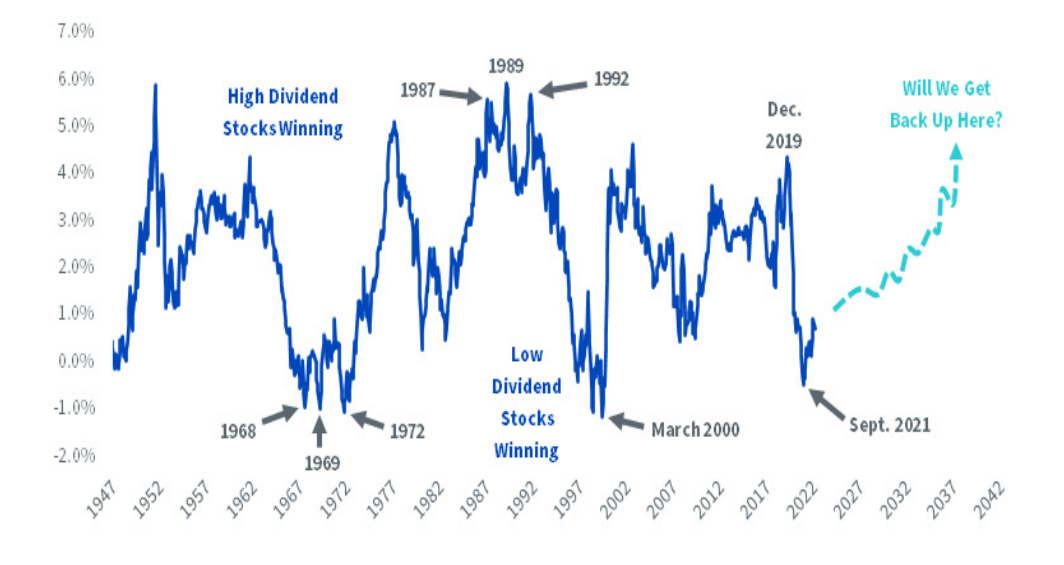
Data 07/31/1927–12/31/2022. The axis begins in 1947 because it is 20-year rolling data. Stocks separated into Top Quintile Minus Bottom Quintile.