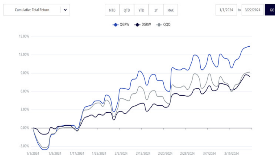
Figure 1b: Cumulative Performance Comparison

Source: WisdomTree, specifically data is from the PATH Fund Comparison Tool, for the period 1/1/24–3/22/24. NAV denotes total return performance at net asset value. MP denotes market price performance.