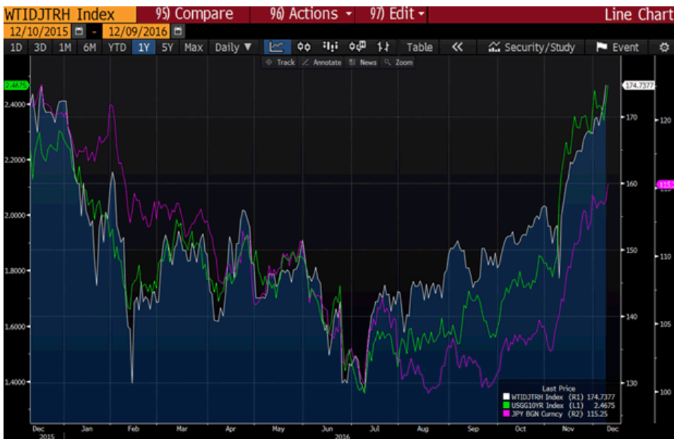
Past performance is not indicative of future results. You cannot invest directly in an index.

Here in the U.S., mid- and small-cap stocks have led the market rally since November 8 and have outperformed most of the major asset classes as shown below. Given the large outperformance of mid- and small-cap companies, is this an area of the market that investors should continue to focus on in 2017? I believe it is, if one can manage for the valuation risk of buying into these asset classes after 2016's large run-up.